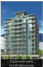
Esplanade West, North Vancouver