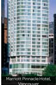
Marriott Pinnacle Hotel, Vancouver