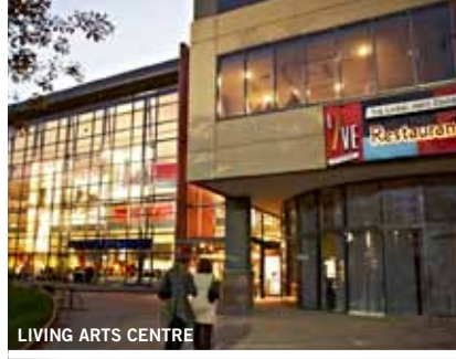
LIVING ARTS CENTRE