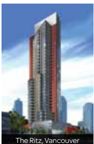
The Ritz, Vancouver