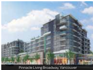
Pinnacle Living Broadway, Vancouver