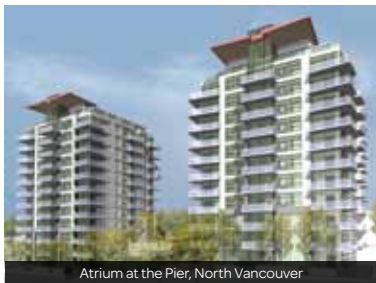
Atrium at the Pier, North Vancouver