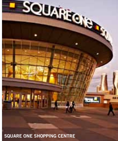
SQUARE ONE SHOPPING CENTRE