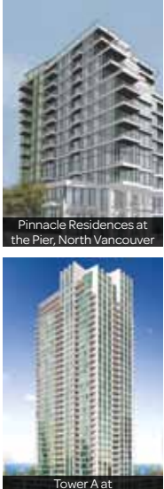
Pinnacle Residences at the Pier, North Vancouver