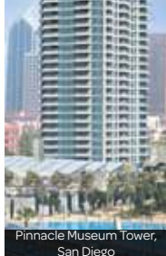
Pinnacle Museum Tower, San Diego