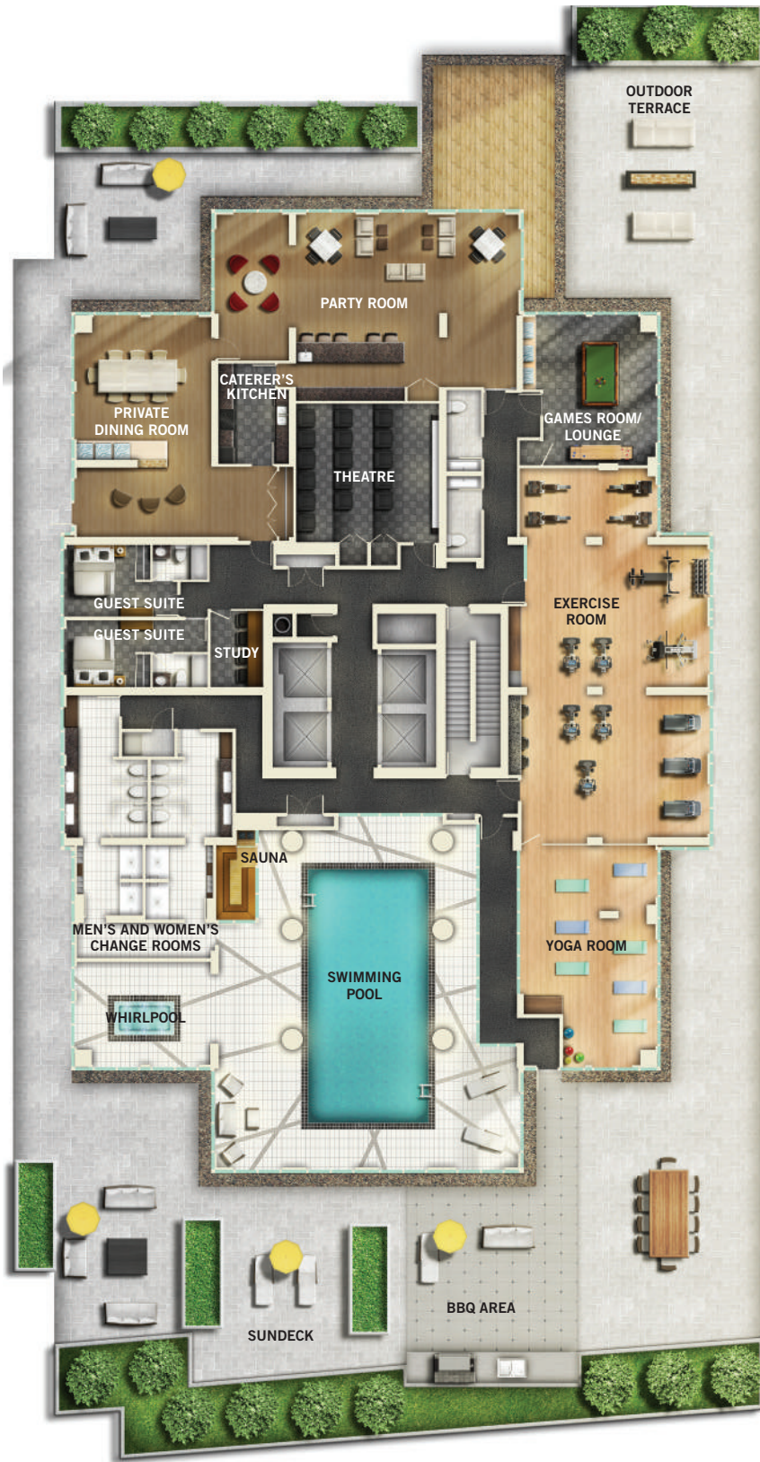
5 th Floor Amenities