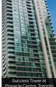
Success Tower at Pinnacle Centre, Toronto