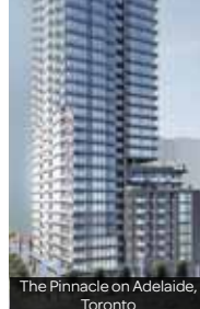
The Pinnacle on Adelaide, Toronto