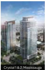
Crystal 1 & 2, Mississauga