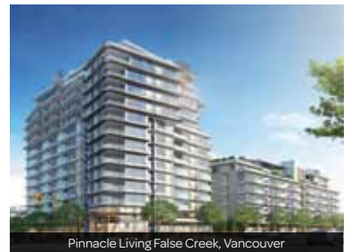
Pinnacle Living False Creek, Vancouver