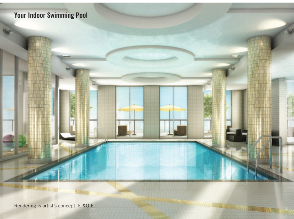
Rendering is artist's concept. E.&O.E.