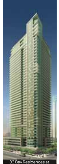
33 Bay Residences at Pinnacle Centre, Toronto