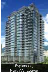
Esplanade, North Vancouver