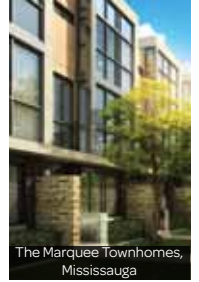
The Marquee Townhomes, Mississauga