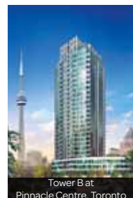
Tower B at Pinnacle Centre, Toronto