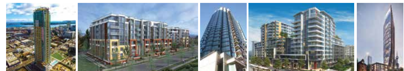
PINNACLE ON THE PARK SAN DIEGO WEST 10TH & MAPLE VANCOUVER CLASSICO VANCOUVER SORRENTO AT CAPSTAN VILLAGE RICHMOND THE PJ TORONTO