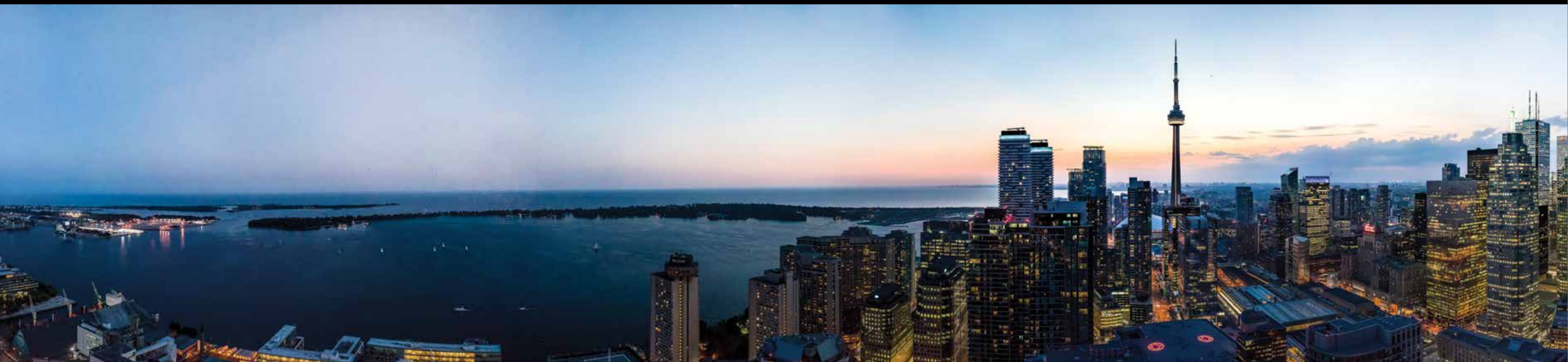
PRESENT VIEW FROM THE 55TH FLOOR