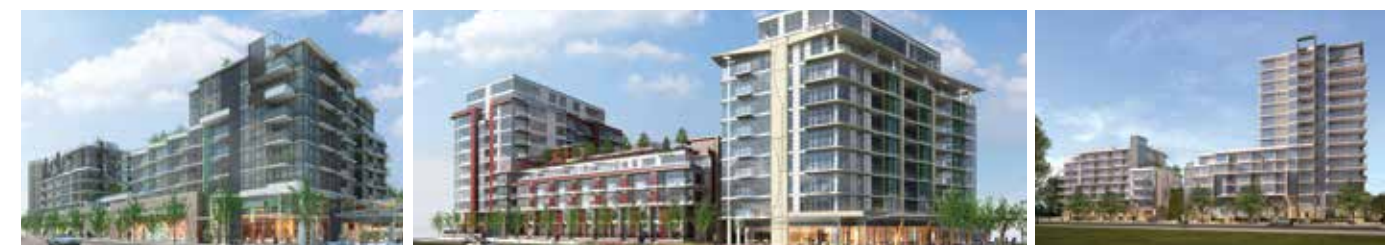
PINNACLE LIVING ON BROADWAY VANCOUVER THE ONE VANCOUVER PINNACLE LIVING CAPSTAN VILLAGE RICHMOND