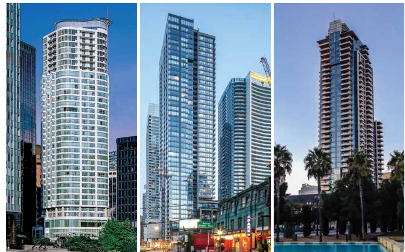
MARRIOTT PINNACLE HOTEL VANCOUVER THE PINNACLE ON ADELAIDE TORONTO PINNACLE MUSEUM TOWER SAN DIEGO

RENDERING IS ARTIST'S CONCEPT ONLY. E.B.O.E.