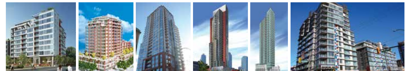
PINNACLE LIVING FALSE CREEK VANCOUVER JADE RICHMOND TAYLOR VANCOUVER THE RITZ VANCOUVER SAPPHIRE VANCOUVER PINNACLE LIVING FALSE CREEK VANCOUVER