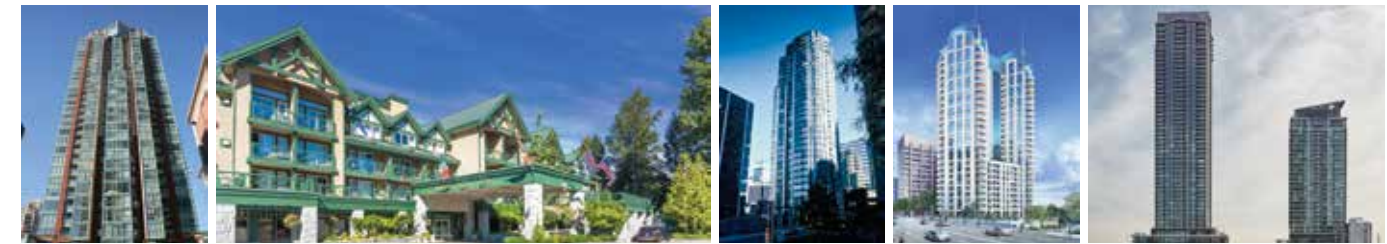
THE PINNACLE VANCOUVER PINNACLE HOTEL WHISTLER VENUS VANCOUVER BELLAGIO TORONTO PINNACLE GRAND PARK 1 & 2 MISSISSAUGA

Discover the visionary lifestyle at Pinnacle Uptown, a Mississauga community where everyday comfort and convenience exists side-by-side with splendour and opulence. Set amidst lush surroundings, Pinnacle Uptown is an urban-suburban enclave where residents can get the best of both worlds.